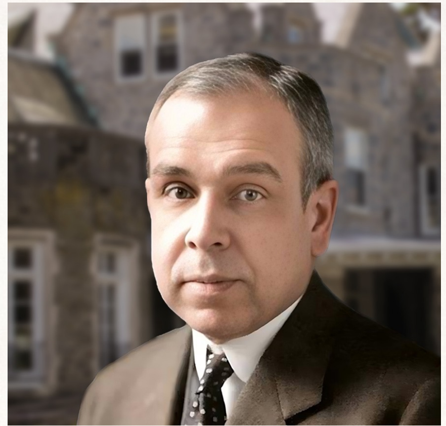
J. Gresham Machen

“Although Christianity does not end with the broken heart, it does begin with the broken heart; it begins with the consciousness of sin. Without the consciousness of sin, the whole of the gospel will seem to be an idle tale. But how can the consciousness of sin be revived? Something no doubt can be accomplished by the proclamation of the law of God , for the law reveals transgressions. . . .