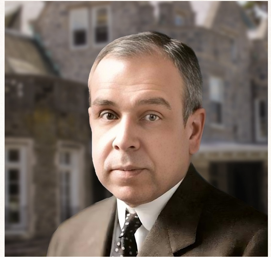
J. Gresham Machen

When a man comes under the conviction of sin, his whole attitude toward life is transformed; he wonders at his former blindness, and the message of the gospel, which formerly seemed to be an idle tale, becomes now instinct with light. But it is God alone who can produce the change.”