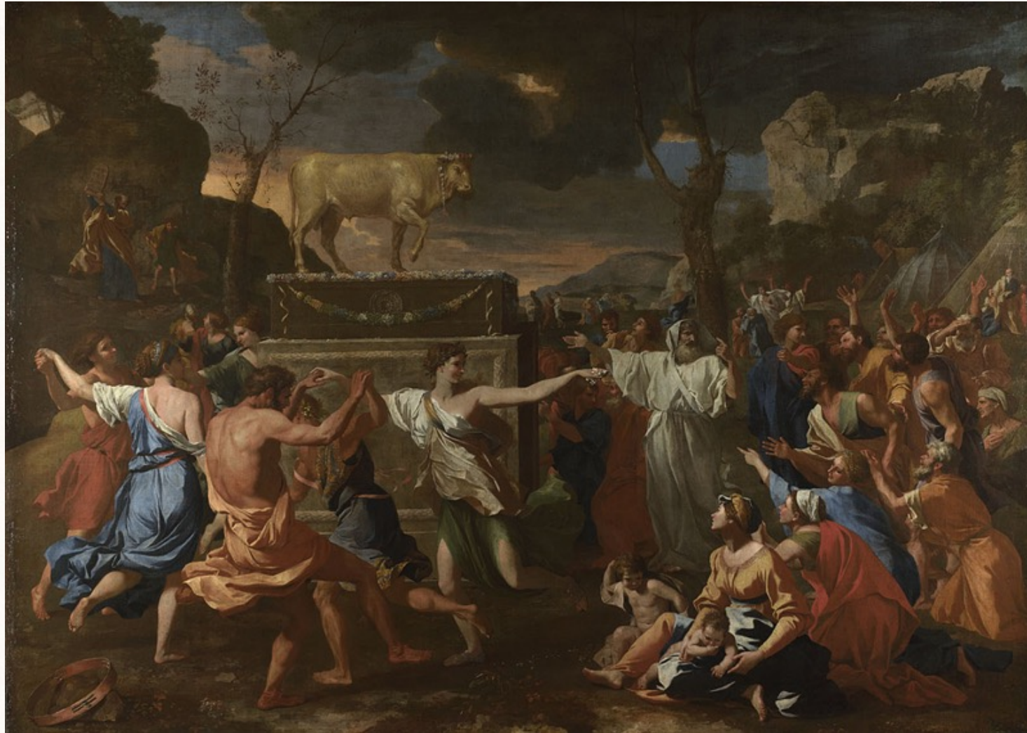
The Adoration of the Golden Calf by Nicolas Poussin, 1634